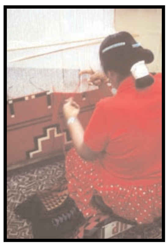
Navajo Weaving

"TIPS": To make your loom, cut notches about 12 mm. (1/2") apart and 5 mm. (1/4") deep at both ends of a piece of colored mat board (often available free from framing shops) or firm cardboard. Wrap string around and around the "loom", catching it in the notches. Tie the ends together on the back of the cardboard. Roll an assortment of yarns into small balls. Keep them in an open box or basket. Keep scissors in the box too.