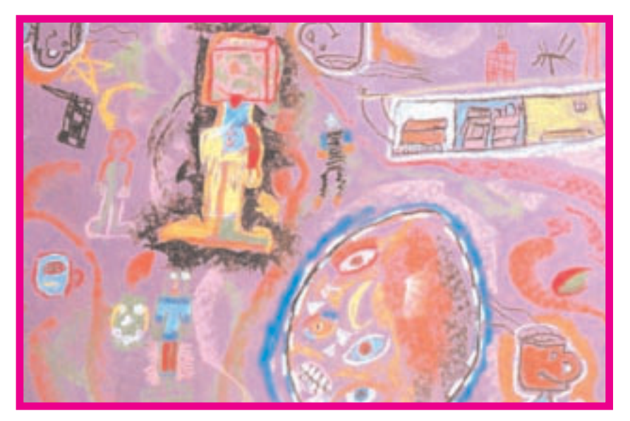
Victor Age 7

MORE IDEAS: Make a fantastic dream picture with tempera paints.