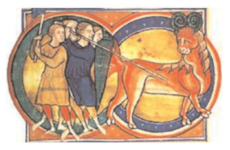
A Bonnacon from a Medieval Manuscript

"TIPS": Talk about animals you know from visits to a farm or the zoo. Look at pictures of a variety of creatures. As you talk, point out and sketch on scratch paper the most important features of each animal.