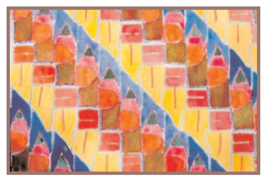
Davie Age 11

4. With a pointed brush, fill in the spaces formed by the crayon boundaries, using the same color in each repeated shape. You will then have a repeated watercolor pattern, as well. Or use whatever colors you choose, randomly, for a different effect.