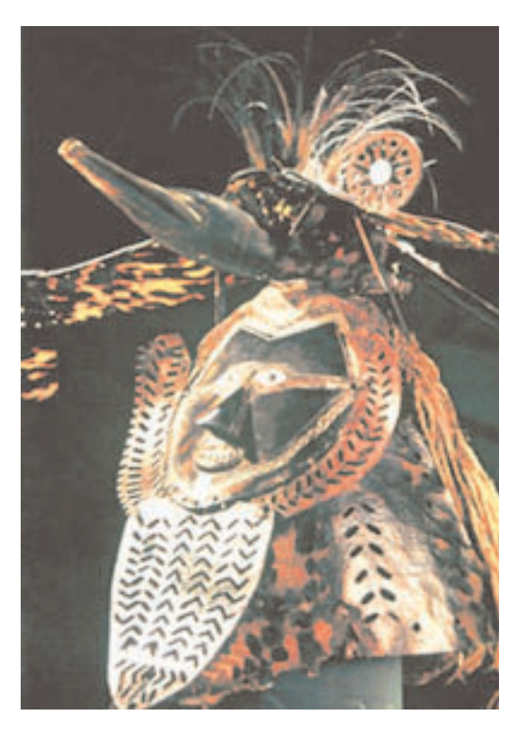
Frigate Bird Mask Papua, New Guinea Metropolitan Museum of Art New York NY

mask for? When do people wear masks? Why do children wear masks at Halloween? There are many reasons for masks besides fun. Often masks are worn for protection, as in hospitals or for sports or games. Sometimes masks are used in dance festivals or special ceremonies. Sometimes they are used to hide ones face so a person can seem to be somebody else. When you wear a