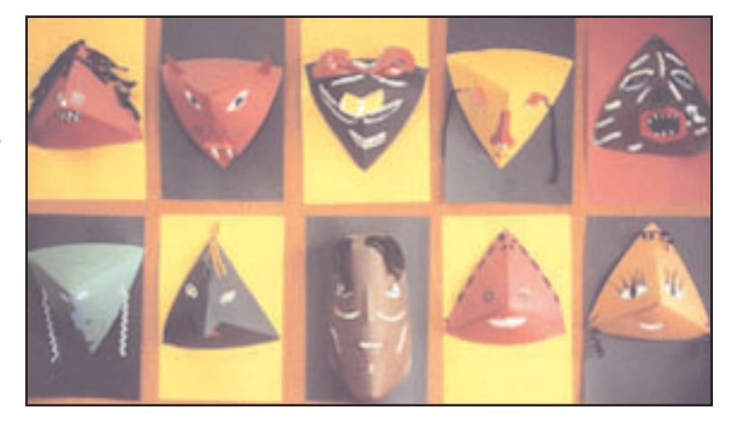
10 Examples of Pyramid Masks

a mustache? ears? earrings? Cut out all the parts you will need.