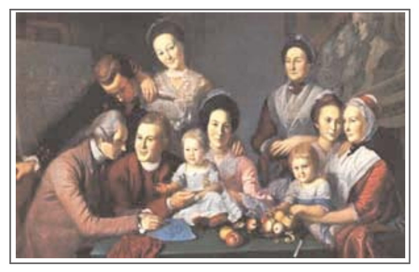
Charles Willson Peale <u>The Peale Family</u> 1809 The NewYork Historical Society