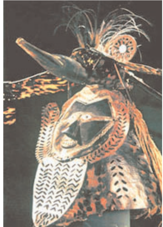
Frigate Bird Mask Papua, New Guinea Metropolitan Museum of Art New York NY

GETTING STARTED: What is a mask for? When do people wear masks? Why do children wear masks at Halloween? There are many reasons for masks besides fun. Often masks are worn for protection, as in hospitals or for sports or games. Sometimes masks are used in dance festivals or special ceremonies. Sometimes they are used to hide ones face so a person can seem to be somebody else. When you wear a