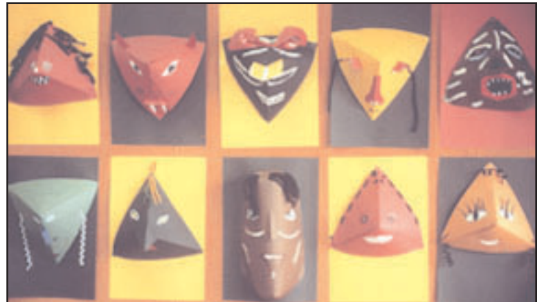
10 Examples of Pyramid Masks

4. Fold a scrap of colored paper in half and cut out a circle or triangle shape as big as your fist. You will find that you have made two shapes that you can use for eyes on your mask. Do not paste them on yet, though.